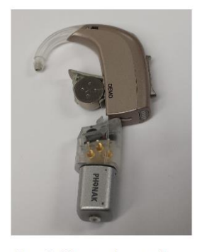
Step 3: Line up the notch on the audioshoe with the track on the hearing aid.