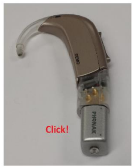
Step 5: Close the battery door and make sure you hear another click.

In the morning, put the audioshoe/receiver on the hearing aid. At the end of the school day, remove the audioshoe/receiver from the aid. Store receivers in a safe place.