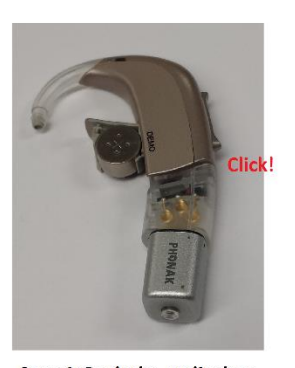
Step 4: Push the audioshoe in until it clicks into place.